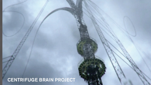
CENTRIFUGE BRAIN PROJECT